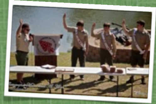
Above - Conclave 2011 (page 1 & 3)